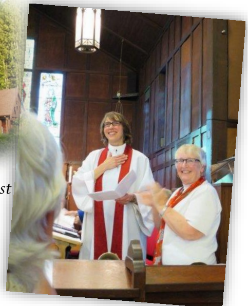
On the right the congregation greets their new minister with love and applause